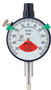
*compact rev 1